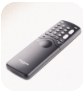
Easy to use, full-function remote control included.

With wide XGA resolution, you see every detail. The flat screen eliminates image distortion and reflection for a clear picture at virtually any angle.